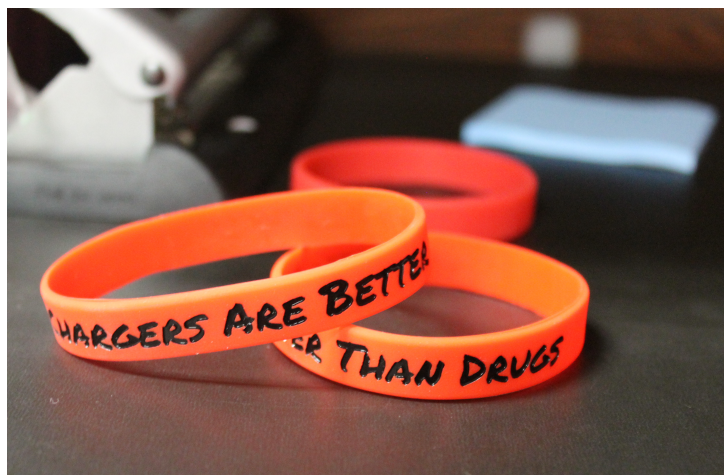
Pledging to be DRUG FREE because Chargers Are Better than Drugs!

Red Ribbon Week 2014 was a fun-filled week Chasco Middle! Our students took part in the theme, "Love Yourself. Be Drug Free" and each day was filled with a variety of activities! Our Student Leadership Advisory Panel helped to contribute to the success of this week!